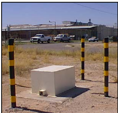
Several monitor wells have been installed at the Park-Euclid WQARF site near locations of historic dry cleaning operations.

There are potential risks associated with exposure to VOCs, principally through drinking contaminated groundwater. No one is known to be drinking contaminated water from this site; however, if you are drinking water from a private well within the boundaries of the site, please contact the ADEQ Project Manager. Cleanup activities are important to ensure the quality of future drinking water supplies.