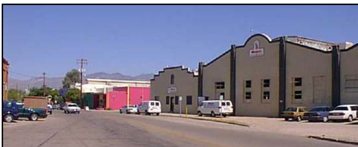
Mission Uniform and Linen Service currently occupies the plant on Park Avenue, south of Broadway Boulevard.

During an early 1990 investigation of diesel contamination conducted by ADEQ, a sample of groundwater was collected from a well on the Mission Uniform and Linen Service (Mission Linen) property. Analysis of the sample indicated the groundwater was