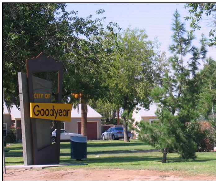
City of Goodyear Well No. 1

In 2008, a new monitoring well (MW #8) was installed on the corner of Los Robles Drive and East