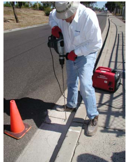
Sampling at North Canal Plume

A community advisory board (CAB) has been formed for the site. These meetings are open to the public. Details of meeting agendas and minutes can be viewed at ADEQ's Web site. The most recent fact sheet can be found on the ADEQ Web site.