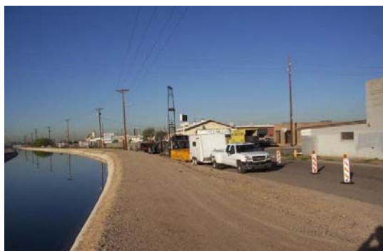
Drilling Monitor Well at Site

1984-2007: Field investigation activities for the Site have been conducted between 1984 and the present time. Several contaminants were detected in soil and groundwater samples collected during field investigations at the four facilities. The primary contaminants of concern found were tetrachloroethene (PCE), TCE, 1,1- dichloroethene (1,1-DCE) and chromium .